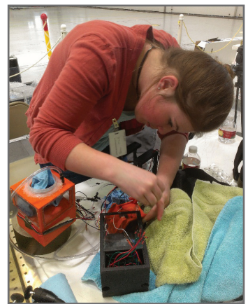
Student preparing hydrofuge for zero-gravity flight

Stratasys | www.stratasys.com | info@stratasys.com