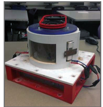
Original design of hydrofuge