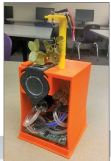
Test version with Tear Drop Chamber showing the 80° contact wetting angle