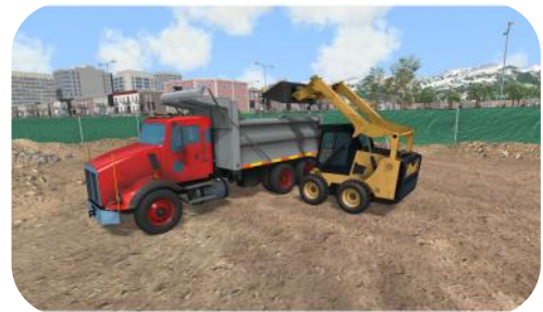
Load a Dump Truck